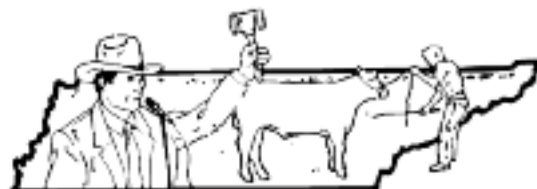
TENNESSEE BEEF AGRIBITION

Junior Show Contact QUINTIN SMITH 5171 Cainsville Road Lebanon, TN 37090 (615) 207-0830