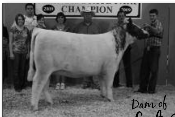
Dam of Lot 27